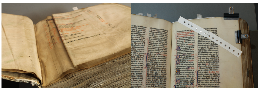
MSI; Images courtesy of Pembroke College, Oxford.

time. Over several weeks, we carefully humidified and flattened each leaf in turn, making them less vulnerable to damage.